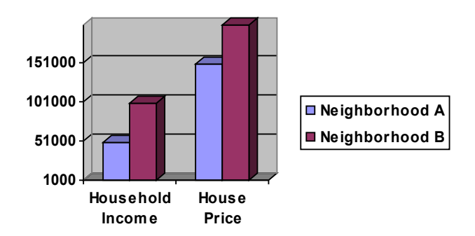
Graph 3: Average Household Income and Median House Price in Thousands of Dollars.

To look for evidence that health outcomes cluster with socioeconomic and racial status of the neighborhood, ask students to also graph demographic data from the US Census, such as household income and race.